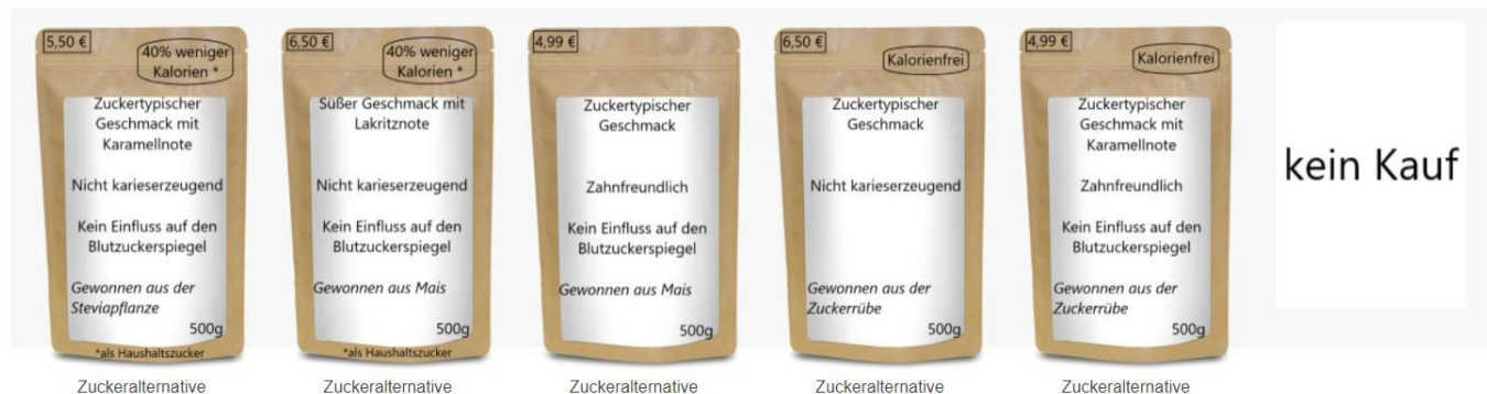
Figure 1. Example of a choice set.

The product alternatives in each choice set were randomized in order and sequence, while the no-purchase option was always presented last. The level selection was based on the characteristics of four sweeteners: allulose, stevia, erythritol, and xylitol. The choice of the selected sweeteners was grounded on strategic competitive decisions of a sweetener manufacturer. The price levels were based on market prices (Rewe, Edeka, and Kaufland) in Germany at the time of questionnaire preparation; €4.99 and €6.50 per 500 g packs were the lowest and highest prices on the market. The respective attributes and levels are shown in Table 1.