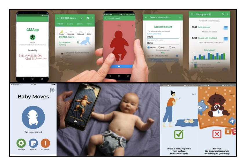
Figure 1. The first General Movement apps: ( upper box ) screenshots of GMApp , including baby silhouette and statistics; baby silhouette of Baby Moves ( lower box ), a video demonstration of the latest version can be accessed via [50].

Moves, NeuroMotion, and InMotion, have all reported positive parent feedback about app usability [35,39,40]. Inter-rater reliability based on video recordings from smartphone apps is similar to that obtained using traditional methods. Raters scoring videos recorded via the Baby Moves app achieved an intra-class correlation coefficient of 0.77 (95% CI 0.75–0.80) for fidgety movements [51]. For videos obtained via the NeuroMotion app, k-alpha statistic agreement ranged from 0.48 to 0.72, with all raters achieving moderate-to-almost perfect agreement [39].