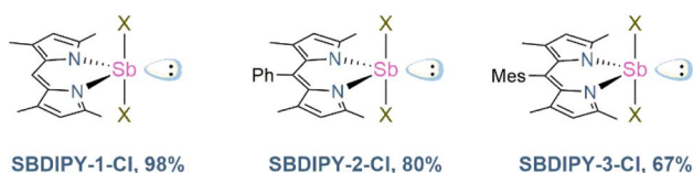
Fig. 2 Isolated SBDIPY complexes.

We next focused on investigating the luminescent properties of these complexes in solution using absorption and emission spectroscopies. The absorption spectrum of SBDIPY-1-Cl