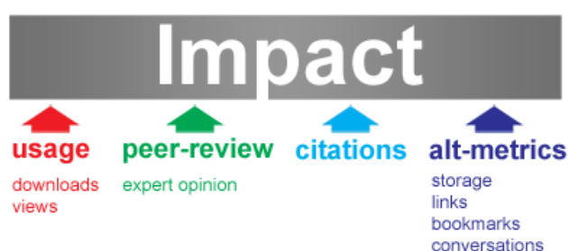
Figure 2. Four ways to measure impact.

Citations (how many and by whom) as the traditional “currency” of the scientific marketplace can be complemented by other measures assessing impact and quality: peer-review, usage statistics and alternative metrics. Together with citation counts, they reflect different angles of impact of scientific outputs [33] as shown in Figure 2.