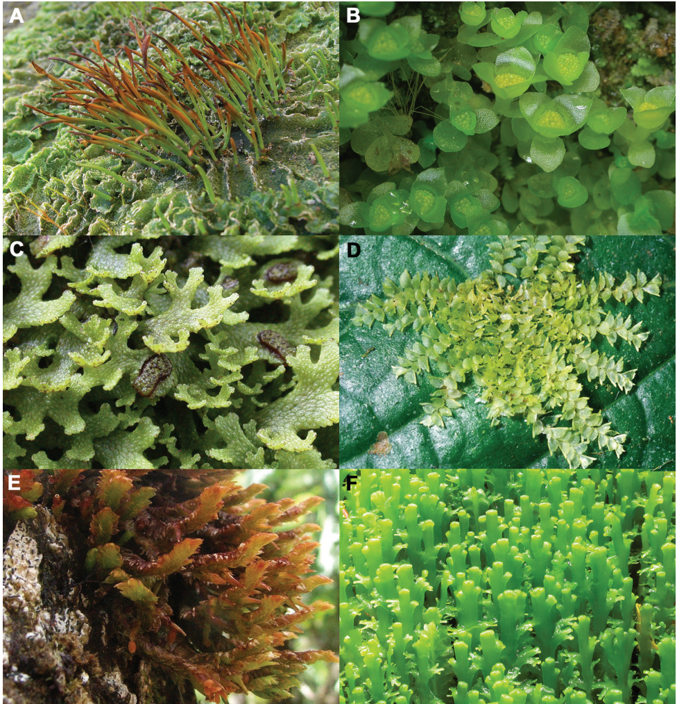
Figure 1. Habit images of selected lineages of Anthocerotophyta (hornworts) and Marchantiophyta (liverworts). A Phaeomegaceros squamuliger, B Haplomitrium mnioides, C Conocephalum japonicum, D Colura vitiensis, E Pleurozia gigantea, F Riccardia spegazziniana