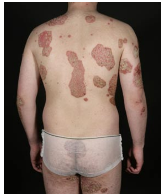
Fig 1 | Patient with severe psoriasis: red scaly plaques cover more than 10% of the body surface area; this patient also has a body mass index >25

The notion of psoriasis being just a skin disease has been challenged by several large epidemiological studies, in which between 7% and 40% of patients with psoriasis eventually developed psoriatic arthritis. 6 The course of psoriatic arthritis is comparable to that of rheumatoid arthritis, as about half of patients show a progressive disease, eventually exhibiting erosions and loss of function in affected joints. 6 Conventional disease modifying antirheumatic drugs, such as methotrex-