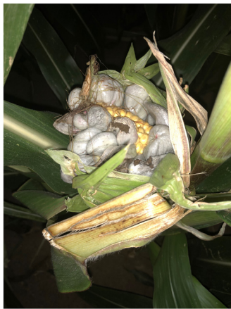
Figure 1. Tumor formation on maize by Ustilago maydis . An infected maize cob found in a cornfield close to Göttingen, Germany, in September 2018. At the end of the growing season, infected kernels give rise to greatly enlarged and bulbous plant tumors filled with black teliospores. Tumors can develop on all aerial parts of the plant but are most prominent in infected cobs.

In this review, we focus on recent genome-wide transcriptome studies of the infection process that have provided insights into the transcriptional regulation associated with disease, the deployment of effectors by U. maydis to manage the infection process, and the remodeling of host metabolism during fungal proliferation. Although not covered here, earlier studies