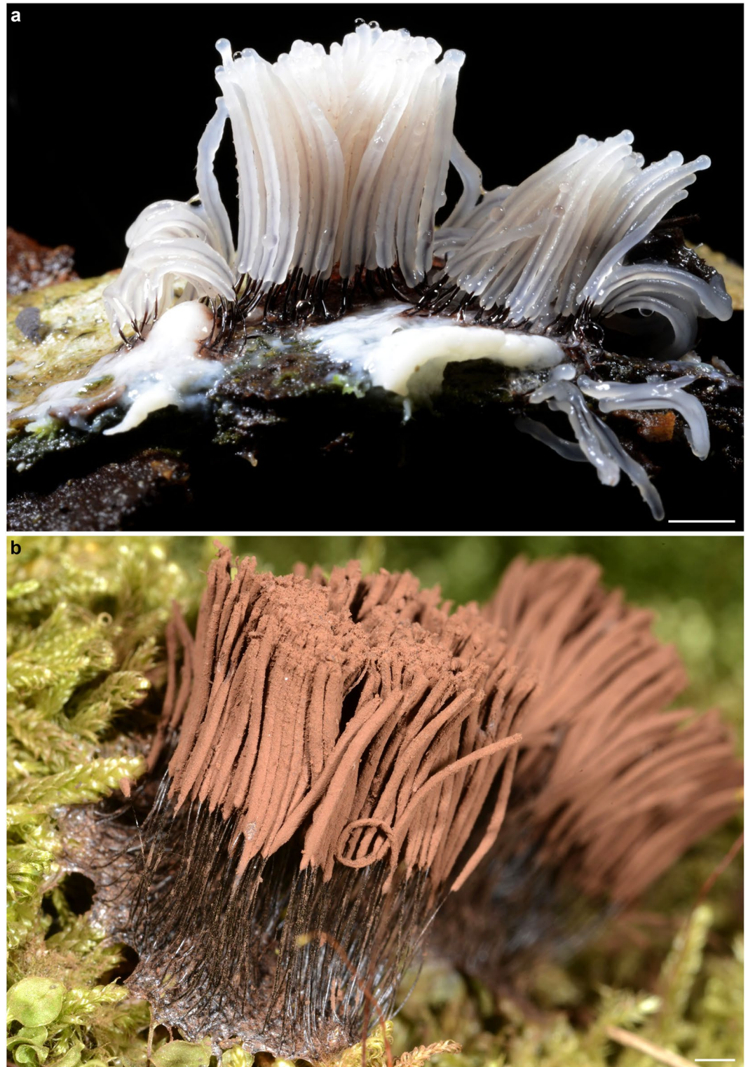
Figure 3. Extant Stemonitis species ( Stemonitis axifera ) producing sporocarps on bark and lignicolous bryophytes (Saarijärvi, Finland). (a) Young sporocarps. (b) Mature sporocarps. Scale bars 2 mm.

the entire lizard was trapped by a resin flow, if not entirely preserved. The shortest distance between the Stemonitis sporocarps and one claw of a toe is only 2.2 mm. There are no insects or other obvious syninclusions except for several branched plant trichomes, which are abundant in Burmese amber, as well as tiny fragments of wood or bark remains, hardened resin, and some quartz (sand) grains.