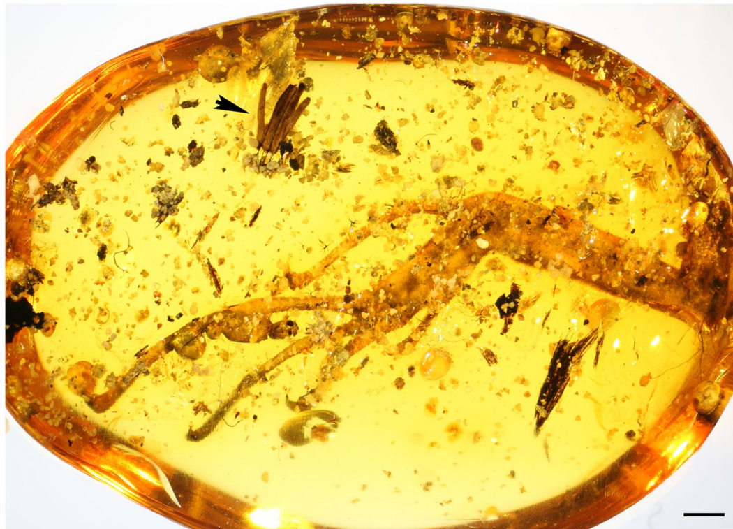
Figure 2. Overview of Burmese amber specimen JZC Bu266 (amber collection of the Division of Invertebrate Zoology, American Museum of Natural History) showing the close proximity of the myxomycete sporocarps (arrowhead) and the hind leg of an agamid lizard. Scale bar 1 mm.

5 \mu m across and larger meshes of 20–25 \mu m across. Spores dark brown en masse, pale brown or translucent in transmitted light, 5–7 \mu m in diameter, with clearly reticulate surface ornamentation.