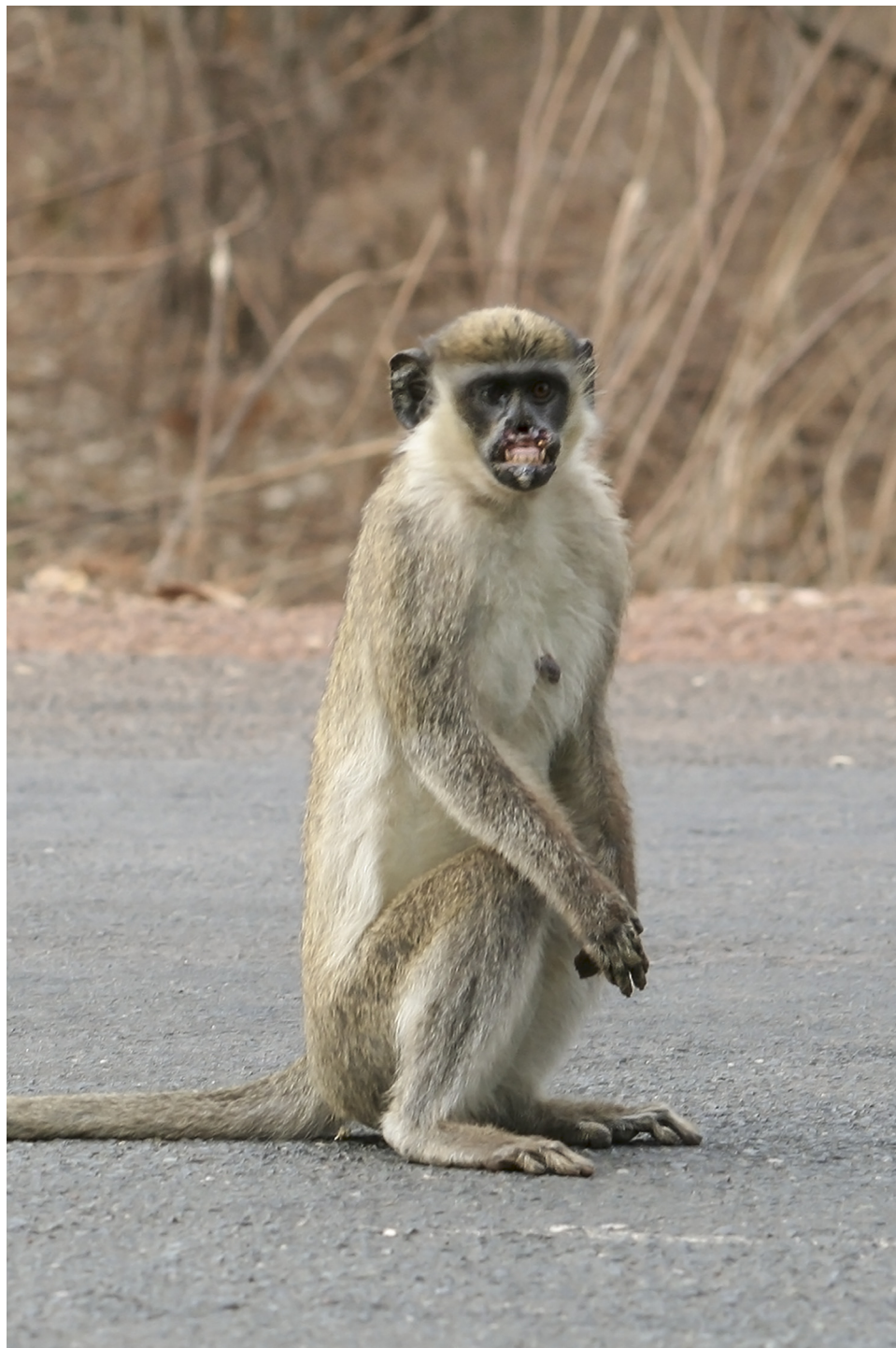
Fig 2. An adult green monkey ( Chlorocebus sabaeus ) with facial lesions at PNNK. The clinical manifestations resemble lesions known from tertiary human yaws infection.