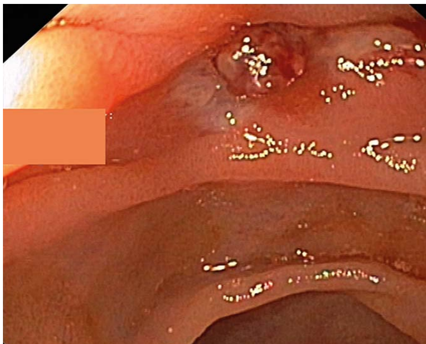
► Fig. 1 Image during single-balloon enteroscopy showing a pulsating Dieulafoy lesion in the distal jejunum.