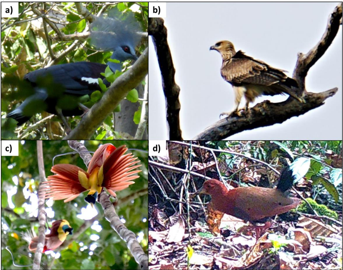
Figure 2. Noteworthy species records for Gam Island, Raja Ampat. a) The vulnerable Western Crowned-pigeon ( Goura cristata ) is still relatively common on Gam but possibly threatened by hunting. b) A pair with two subadults of the near-threatened Gurney's Eagle ( Aquila gurneyi ) were observed on Gam Island. c) The near-threatened Red Bird-ofparadise ( Paradisaea rubra ) is a common resident in the lowland forests of Gam. d) The Bared-eyed Rail ( Gymnocrex plumbeiventris ) was previously only known from mainland New Guinea and possibly from the island of Batanta.

listed as vulnerable . The Red Bird-of-paradise ( Paradisaea rubra ) (Figure 2c) was the only observed species endemic to the Raja Ampat archipelago.