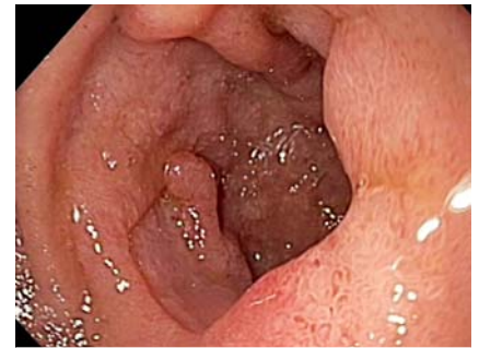
► Fig. 2 Follow-up endoscopic view after 6 weeks showing a clean ulcer base, with no signs of bleeding. The over-the-scope clip and endoloop had both fallen off.