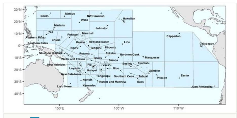
Figure 1. doi

To address research questions in an objective and accessible way, databases are required that contain occurrences (presences) of naturalised plant species and harmonised region information that span the whole Pacific Region, while also being interoperable with other databases (e.g. origin, BIEN, TRY and GIFT; Kattge et al. 2011, Weigelt et al. 2019, Cham berlain and Bartomeus 2020, Maitner 2020). Additional features, such as cultivation and invasive status, can extend the range of applicability. The Global Naturalised Alien Flora (GloNAF) and the Pacific Island Ecosystems at Risk (PIER) databases meet these criteria. While these databases provide unique information on species' characteristics (e.g. cultivation, invasive status), they also overlap in information for many naturalised species and locations. However, even when the information overlaps between the databases, there are sometimes different names or spellings for the same islands or species and there is also variation between the databases in the quality and method of evaluating species invasion status. In addition, information is available inconsistently at different spatial scales, namely at island group and individual island level. These sources of data variation in the databases present a challenge to the direct combination and use of the databases in a single study.