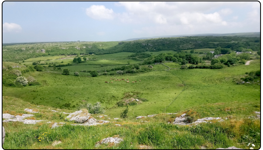
Figure 3. The Burren region of Ireland is an example of the pathway toward “viable HNV farmlands”; here, numerous approaches are employed to increase socioeconomic viability ( www.hnvlink.eu/innovations/the-burren-ireland ). Strategies include innovative results-based payments for ecosystem services that create markets for HNV public goods; connecting people and nature through place-based education programs; honoring farmers with Farming for Nature awards, which increases awareness among both farmers and wider society; and adding value to HNV farmlands through product development and ecotourism initiatives, including food trails. These and other strategies are coupled with knowledge-sharing and capacity-building programs for farmers and advisors.

Under the “viable HNV farmlands” scenario (Figure 2), maintaining farmland biodiversity and the supply of ecosystem services will depend on increasing the socioeconomic viability of the underlying farming systems while retaining similar levels of management intensity. Pursuing socioeconomic viability will require tailored actions and operational tools to be developed, tested, and implemented at the farm level. On top of that, moving toward “viable HNV farmlands” (Figure 3) generally entails a strong commitment from society (including researchers, civil society, stakeholders, and politicians) and especially farmers, who are ultimately the most important stewards of agricultural landscapes (Garibaldi et al. 2017). Transition toward “viable HNV farmlands” would also require a transformational process that extends far beyond the promotion of traditional low-input farming practices (Fischer et al. 2012, 2017). Several of the most urgent requirements for increasing the socioeconomic