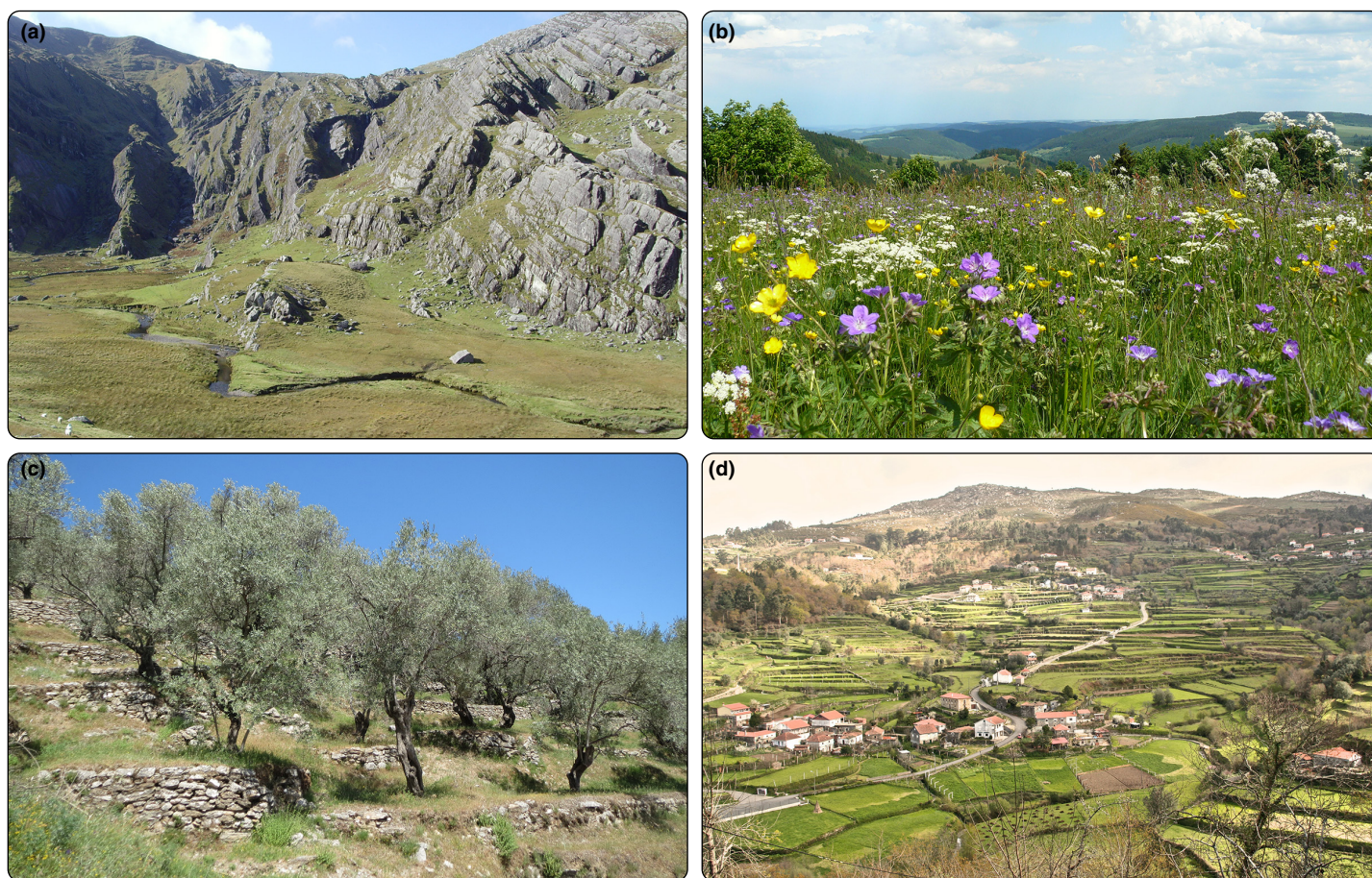
Figure 1. Diversity of high nature value (HNV) farmlands across a variety of different European landscapes. (a) Sheep-grazed, peatland-dominated farms in southwest Ireland; (b) extensively managed, species-rich upland hay meadows in the Thuringian Forest, Germany; (c) terraced olive groves on the island of Lesbos, Greece; and (d) traditional agricultural terraces maintained by small-scale mixed farming in Portugal.

thereby contributing to both sustainability and resilience in the European countryside (Plieninger and Bieling 2013; Lomba et al. 2014; Plieninger et al. 2019). Supporting functions (eg primary production, nutrient cycling, soil formation) are responsible for the sustained supply of a broad range of ecosystem services. Provisioning services include food production, fodder for livestock, and water supply, while cultural services include recreation, agro- and ecotourism, sense of place, and maintenance of cultural heritage and scenic landscapes. HNV farmlands also sustain important regulating services, including climate regulation, prevention of soil erosion, pollination, and biological control (Oppermann et al. 2012). Finally, the soils of HNV farmlands contain higher levels of organic carbon than the soils of non-HNV farmlands, underscoring their potential contribution to climate regulation, maintenance of soil fertility, and prevention of soil erosion and desertification (Gardi et al. 2016). Supporting functions (eg biodiversity maintenance), regulating services (eg erosion control, fire risk prevention) and cultural services (eg the aesthetic, historical, and recreational values of the landscape) provided by HNV farmlands are recognized and economically valued by