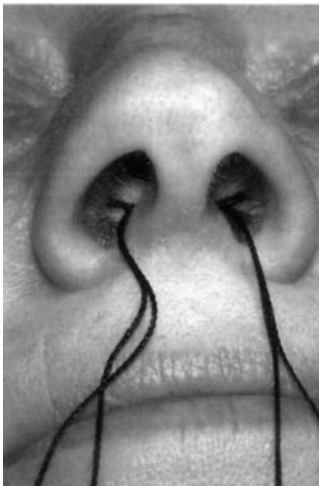
Figure 1 Sponges placed in each nasal cavity. The sponges are attached to a small thread for removal. Once they have contact to liquids, they expand and cover a large area of the mucosa of the nasal septum and the lower and middle turbinates.

According to Kim et al. [16] we handed out a nose-diary in which the patients recorded the number of tissues used per day (each tissue was only used once), the number of sneezing per day and scored symptoms like nasal secretion and nasal congestion on a four-point scale (0 = no, 1 = mild, 2 = moderate, 3 = moderate to severe and 4 = severe), starting two weeks before the first treatment. The occurrence of a dry nose, smelling disorders or epistaxis was recorded daily. All patients were advised not to take any additional nasal therapy. The patients were followed up week 1, 2, 4, 8 and 12. The inspection of the nose diary, the patients' over all impression of the treatment and the clinical examination (anterior rhinoscopy) were done in every follow up and formed the basis for evaluating the study.