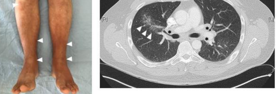
Figure 1. Clinical and radiographic findings in patient #2. ( A ). Extensive rash with erythema nodosa on both legs (arrowheads). Ankles were swollen and tender. ( B ). Chest computed tomography showing interstitial pulmonary infiltrates (arrowheads) and lymphadenopathy (asterisks).